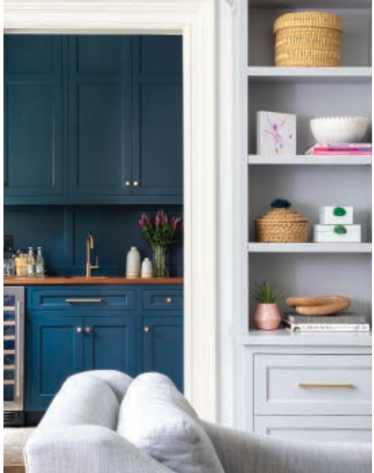
From top: Off the family room sits a colorful bar area outfitted with a wine fridge; the breakfast room provides the ideal space for casual dining on O&G Studio ( oandgstudio.com ) chairs at a Redford House ( redfordhouse.com ) table. Opposite page: The neutral living room, featuring pops of blue.

on this early-20th century Newton home, an eye-catching, multihued result was inevitable. She is certainly no stranger to color, but the owners needed some convincing. "Most clients who hire me tend to really like color, so one of the most exciting parts about this particular project was really getting my client to feel comfortable with bolder choices that she might have not otherwise chosen," says Fineman. After about two years of designing, the result was a 7,500-square-foot space, encompassing six bedrooms and five full and two half-baths. While contemporary touches adorn each room, the builder, Peter Hajjar ( northhudsonllc.com ), ensured the historical aesthetic of the property remained, leaving behind details like original flooring, molding and banisters. "It definitely feels like an old home," notes the designer. "The builder did a really nice job of keeping the soul of the home alive." On top of maintaining the Old World essence and appealing to the client's transitional style, Fineman was tasked with crafting areas that felt approachable and functional for daily life. "They wanted their