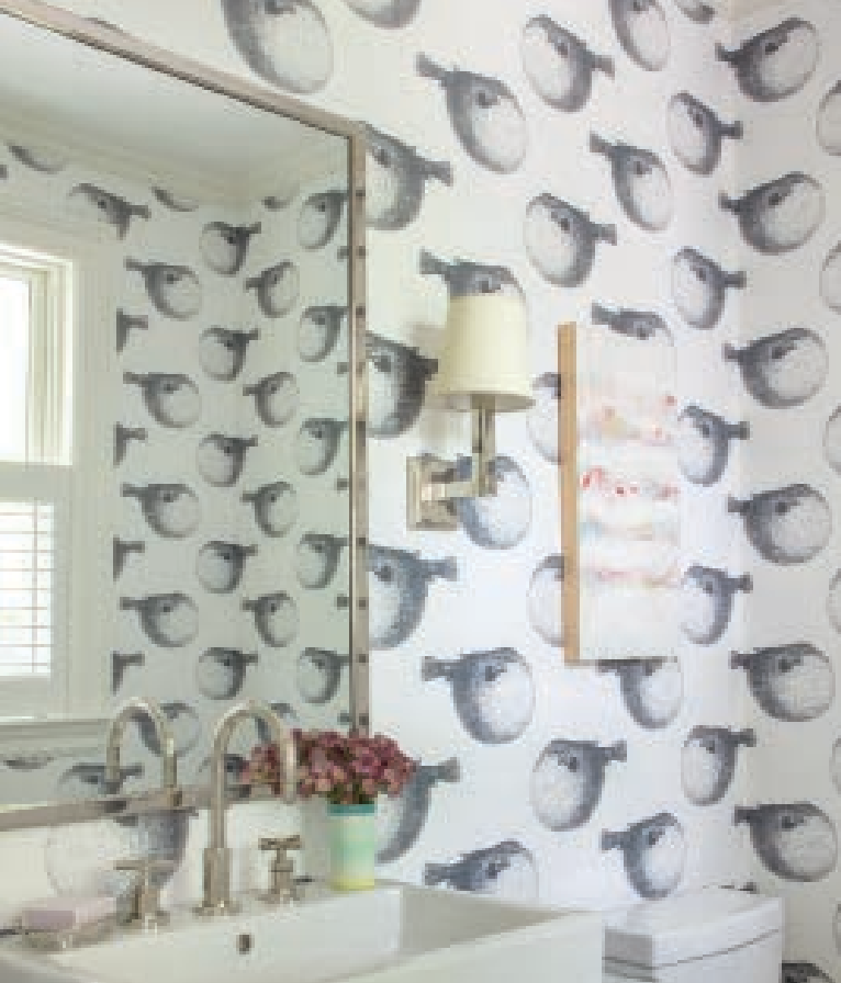
From top: Peek inside the mudroom's half-bath to find the playful Abnormals Anonymous ( abnormalsanonymous.com ) wallpaper Mr. Blow; in the office, the client took a bold leap with Fiddle Leaf Fig wallcovering from Ferrick Mason ( ferrickmason.com ). Opposite page: A Visual Comfort ( visualcomfort.com ) light fixture illuminates the kitchen.